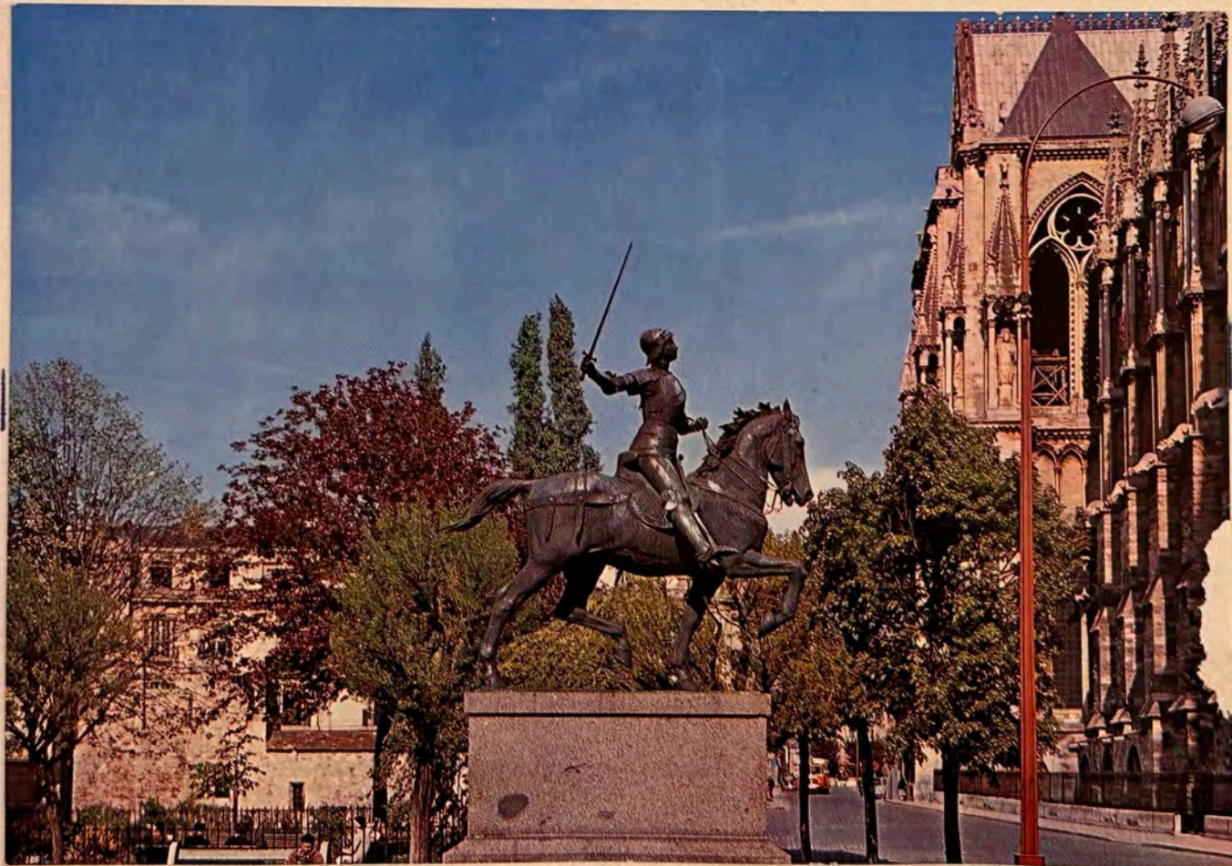
Jeanned'Arc by... Dubois

inside cathedral. Magnificent tapestries, astronomical clock (19th. good stalls, the highest choir in France. Beautiful stained glass. Compiègne - over the river - by the forest, past the 194-1915 Armistice site. Past the race track at Reims (24 hour car race in July), into the town. Parked by the cathedral. Saw statue of Joan of Ark - looked as if she had sat on a pin. Into cathedral after inspecting the facade - being cleaned. Laughing angel. - Visitation & Presentation. Catafalque in cathedral. 3 notable things. ① Rose west window overleaf. ② Tapestries. ③ Statue of Joanne d'Arc at the sacre. Decided we must have champagne at Reims so into café in square & ordered a \frac{1}{2} bottle from a drunk looking waiter. The reason he seemed drunk was soon apparent - he had to taste each bottle before serving then conjure his glass away. It cost us £11 for a half bottle !!! winecents abroad.