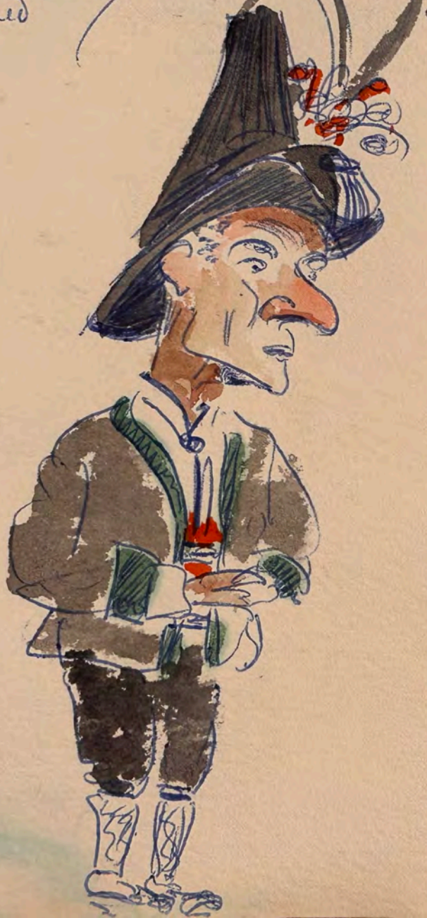
The Master of Ceremonies.

Wednesday 1.9.65. Raining like stink but with a promise of sunshine which never became more than fitful watery. Frühstück. lovely rolls - butter & jam. Coffee for kids & for us. Photograph of Frau then off into Mayrhofen bigger than ever and taller than ever. of Germans, looked round town & in Norodes which was packed with people & very expensive. Noroder