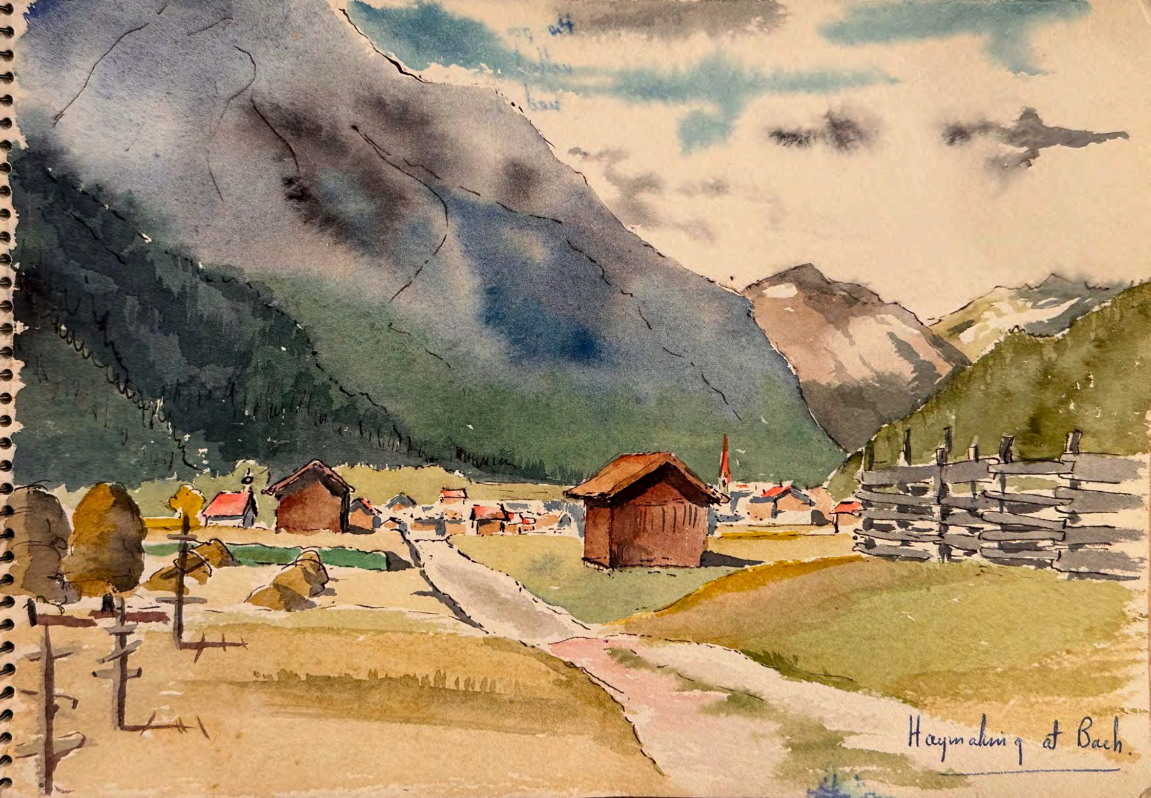
Haymaking at Bach.