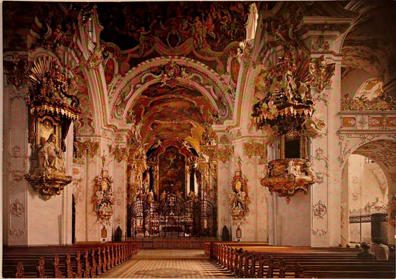
Interior of Einsiedeln Monastery Church.

Fewy fat Anigid Frauo Inrightfully Frustrated. Longing frantically a firsawang to Fuedlan.