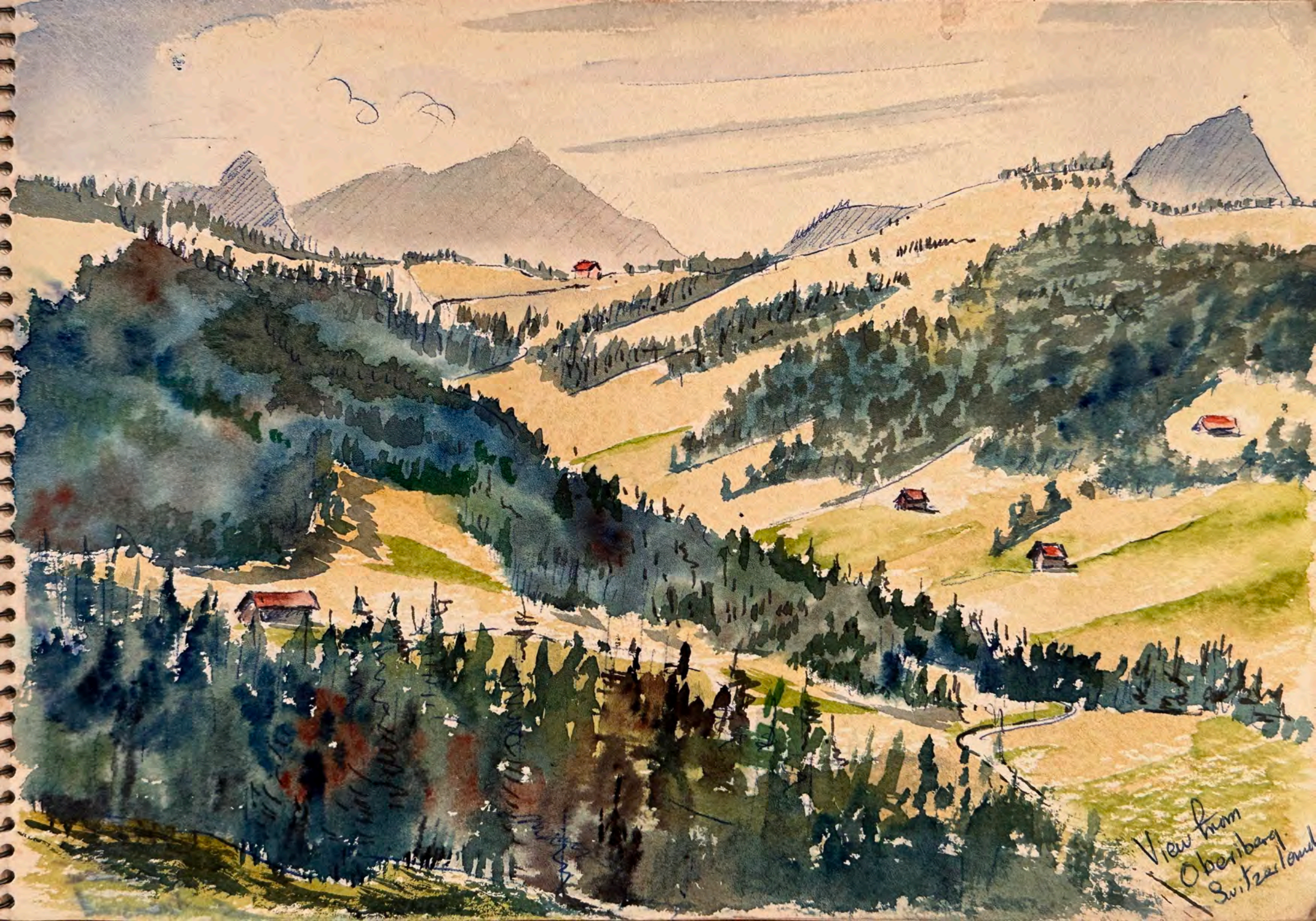
View from Oberberg Switzerland